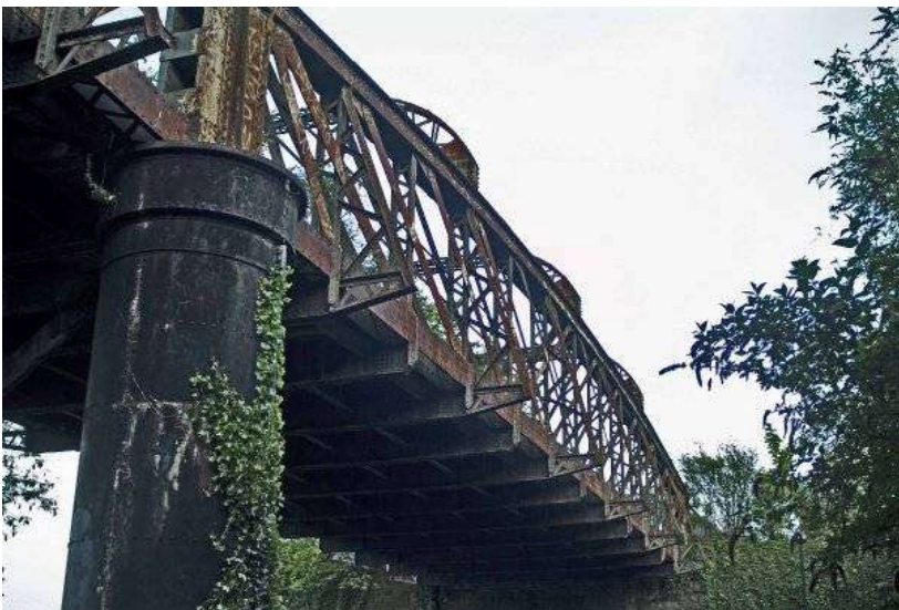
An extra two tracks here please.

On the First Anniversary of the improved service, in May 2009, FOSBR, in keeping with WEP policy, called for double tracking of the stretch of line between Redland and Montpelier Stations in order to allow trains to pass.